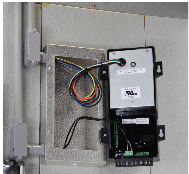
Installation using the items included in the KE2 Ultimate Install Kit and the optional Wire Harness.

NOTE: To help speed installation even more, KE2 Therm offers a wiring harness. The 9-wire harness is color coded, and has the appropriate gauge of wire and connection for each terminal on the KE2 Evaporator Efficiency controller. The harness is available with 25' and 40' leads. For more information on the Wire Harness, see the backside of this bulletin.