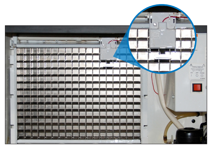
After cleaning ice machine