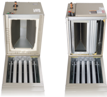
ADP A-Coil on furnace N-Coil on furnace

HydroTEC™ drain pan design for lower water retention