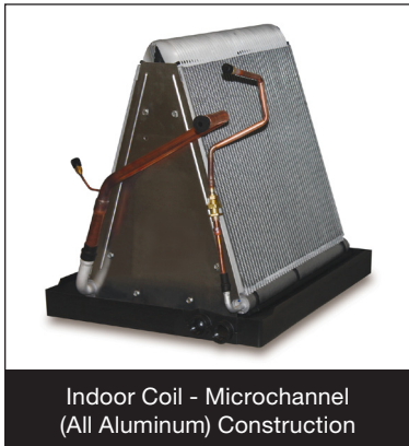
Indoor Coil - Microchannel (All Aluminum) Construction