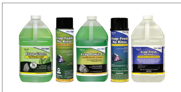
EVAPORATOR COIL CLEANERS