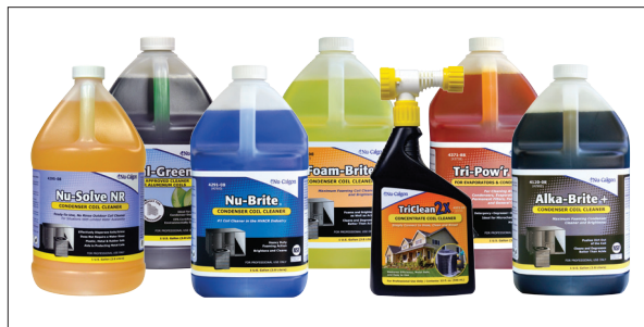
CONDENSER COIL CLEANERS

Regular cleaning with Nu-Calgon products protects equipment and helps maintain peak operating efficiency.