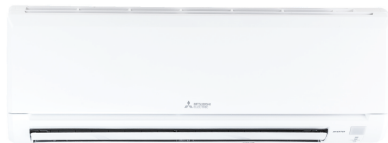
Indoor Unit: MSZ-GL12NA