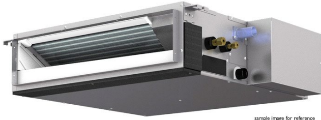
sample image for reference