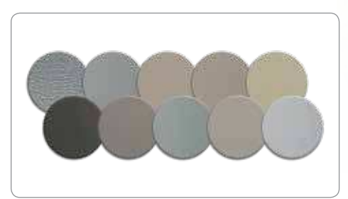
Painted cabinet options for furnace color coordination

Dual drain connections on each side for ease of installation