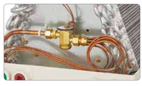
TXV with all threaded connections saves time in the field